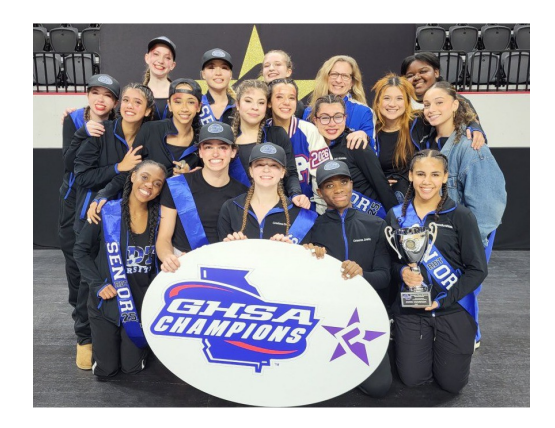
6A Peachtree Ridge