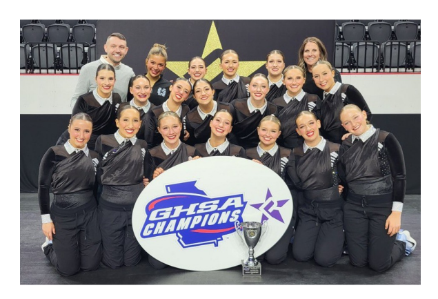
4A-5A Starrs Mill