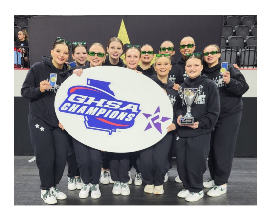
2A-3A Heritage Catoosa