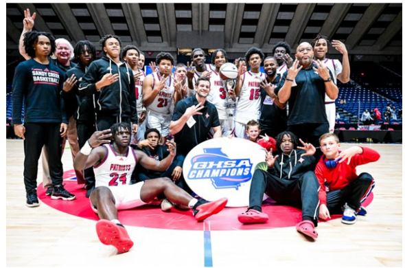
Class 3A Boys - Sandy Creek