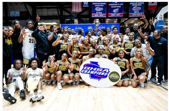
Class 2A Boys - Butler