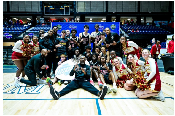
Private Boys - Holy Innocents'