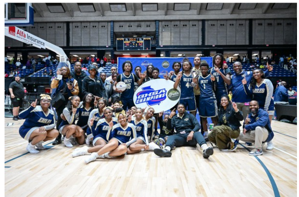
Class A-D1 B.E.S.T. Academy