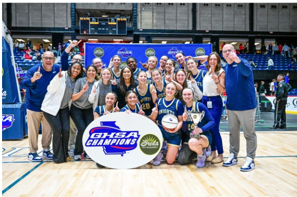
Class 5A Girls - River Ridge