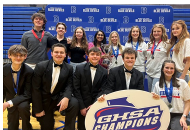
Bremen (A-Div I)