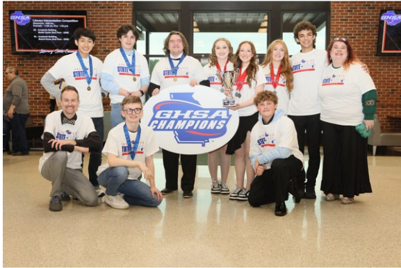
Houston County (5A)