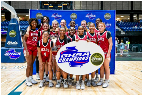
Private Girls - Holy Innocents'