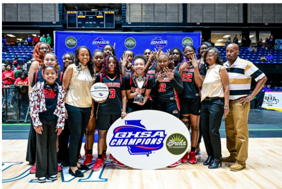
Class 2A Girls - Hardaway