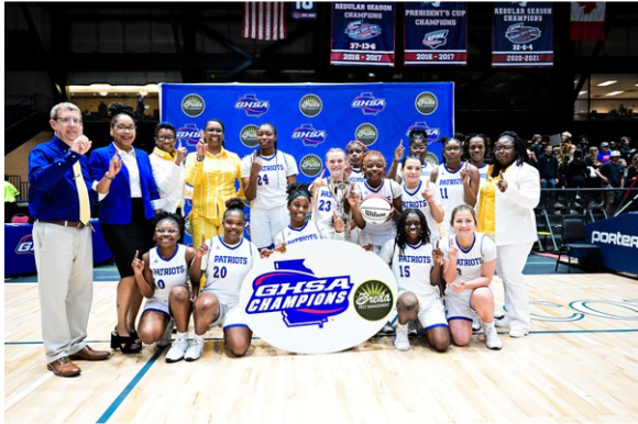
Class A-D2 Girls Wilcox