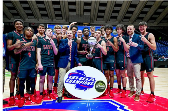
Class 4A Boys - North Oconee