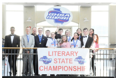
GMC Prep (A-Div II)