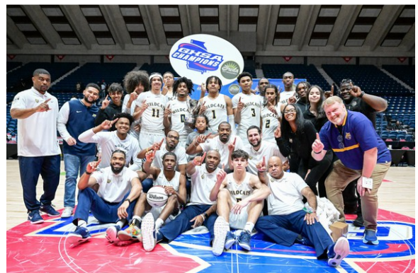
Class 6A Boys - Wheeler