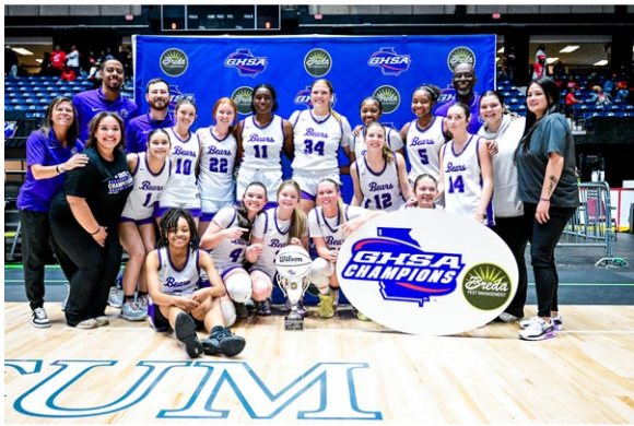
Class 3A Girls - Cherokee Bluff