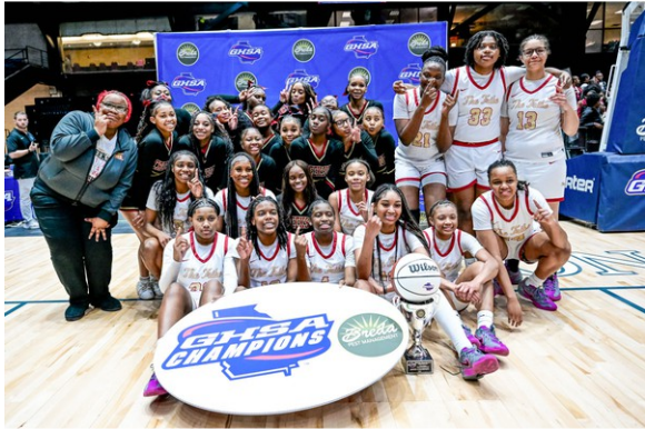
Class 4A Girls - Creekside