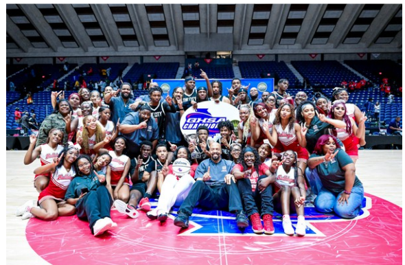
Class 5A Boys - Tri-Cities