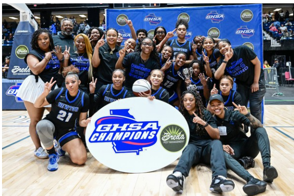
Class 6A Girls - Newton County