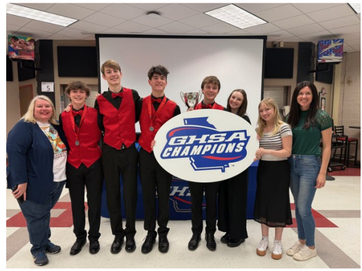
North Oconee (4A)