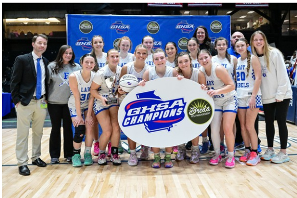
Class A-D1 Fannin County