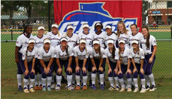
7A: East Coweta