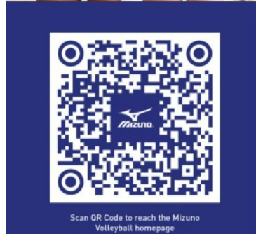
Scan QR Code to reach the Mizuno Volleyball homepage