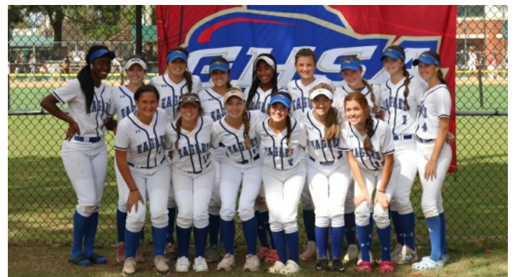
A (private): Mt. Paran