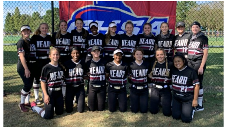
2A: Heard County