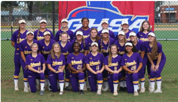
5A: Jones County