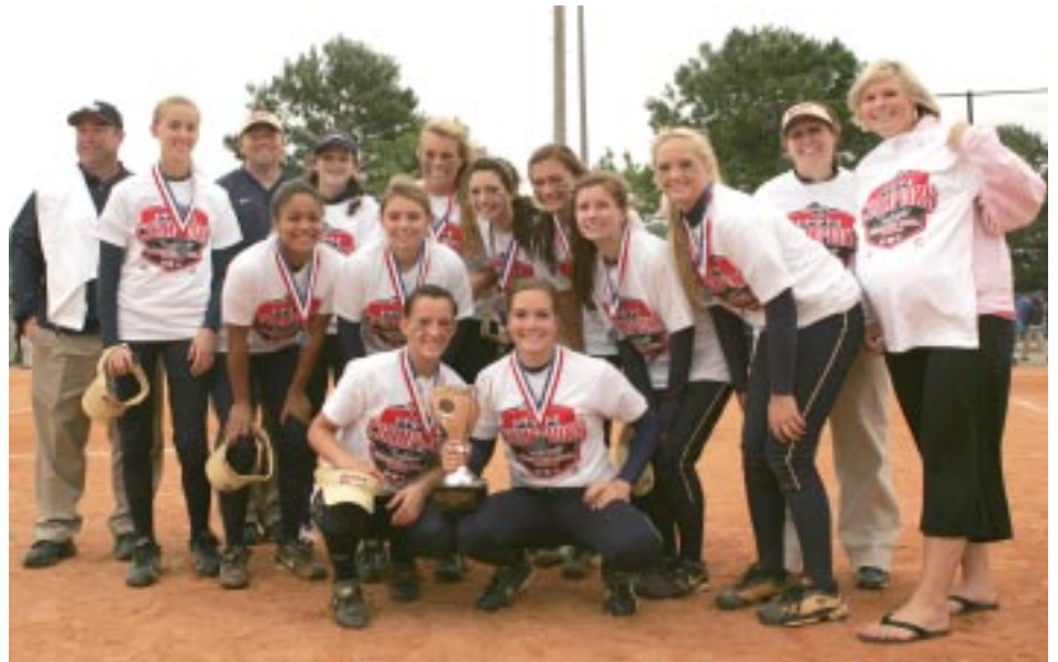
Class A Eagle's Landing Christian Academy Lady Chargers