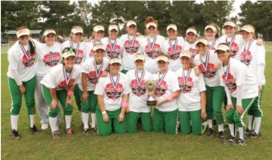
Class AA Buford Lady Wolves