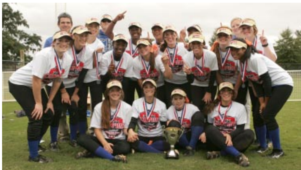
Class AAA Columbus Lady Blue Devils