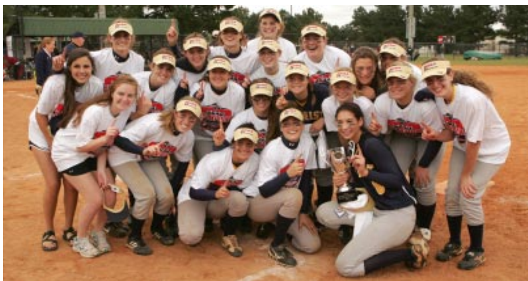
Class AAAA Marist Lady War Eagles