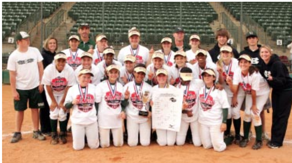
Class AAAAA Collins Hill Lady Eagles