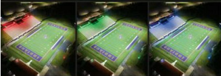
Show-Light® technology enhances the fan experience with special effects and light shows.