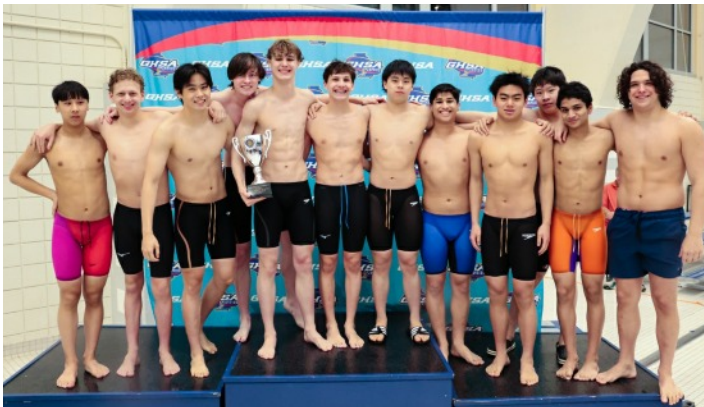
6A Boys: Johns Creek