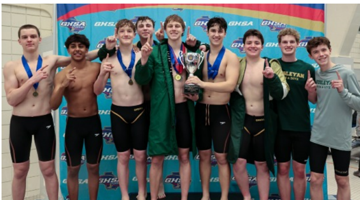
A-3A Boys: Wesleyan