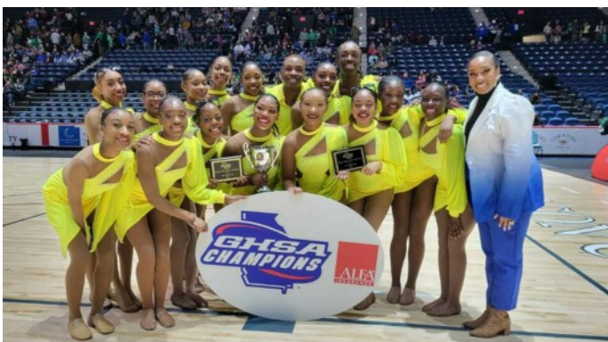
A-2A: Stilwell Arts