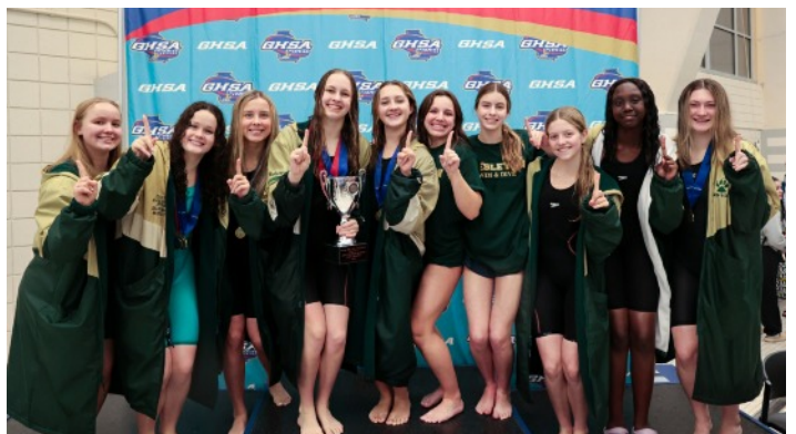
A-3A Girls: Wesleyan