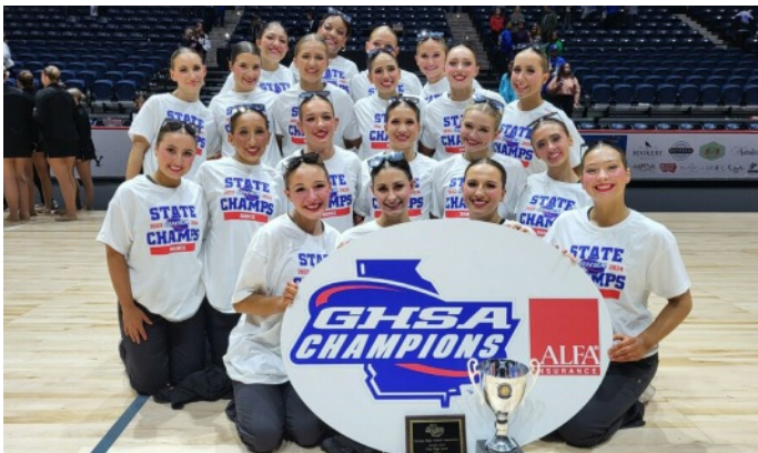
3A-4A: Starr's Mill