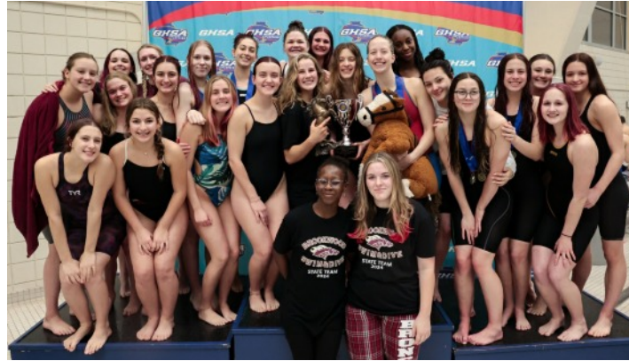
7A Girls: Brookwood