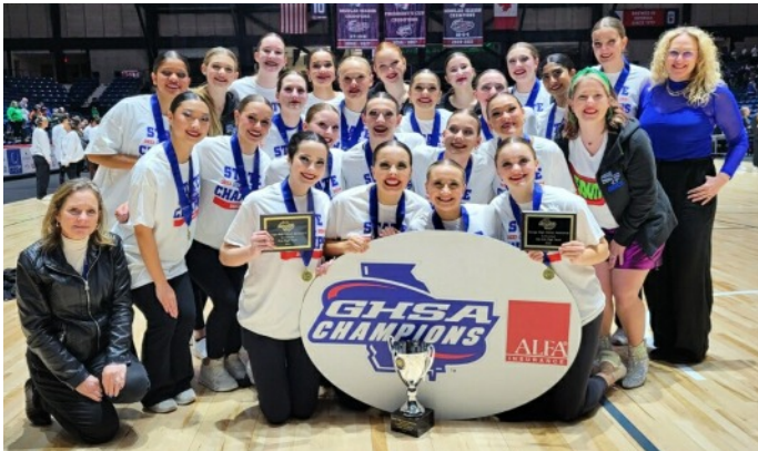
7A: South Forsyth