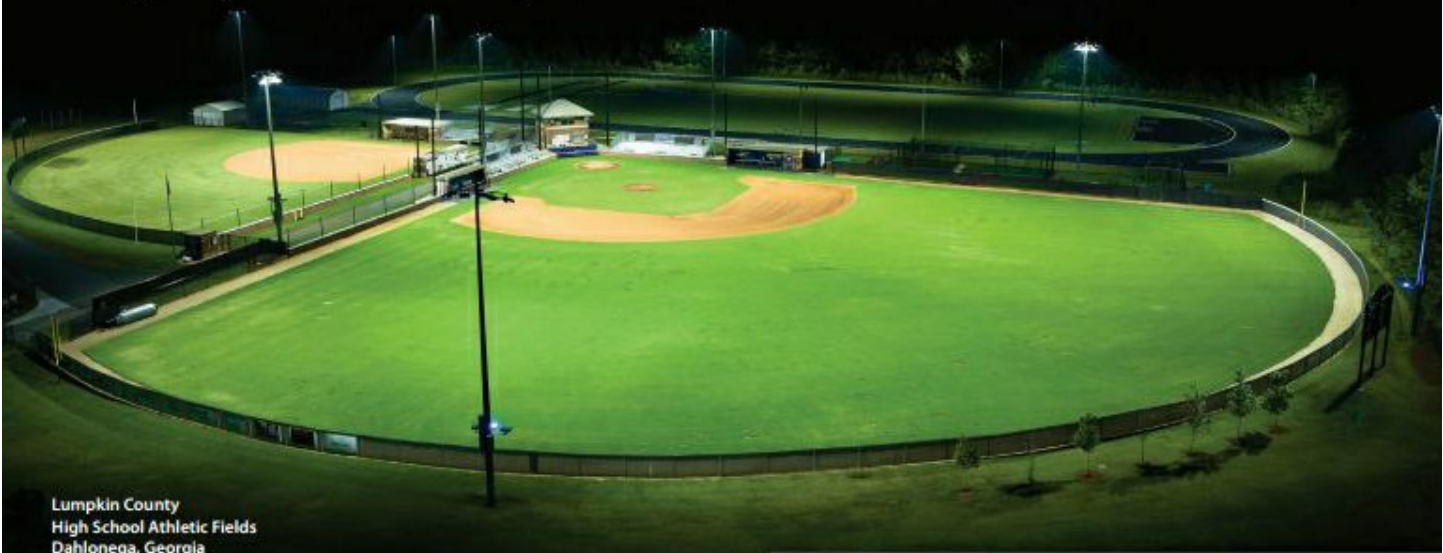
Lumpkin County High School Athletic Fields Dahlonega, Georgia

Musco has been the world leader in sports lighting since 1976, designing systems for everything from neighborhood fields to major stadiums and arenas around the globe. Musco's TLC for LED® technology delivers unmatched light quality, control, reliability, and glare reduction, backed by a long-term parts and labor warranty.