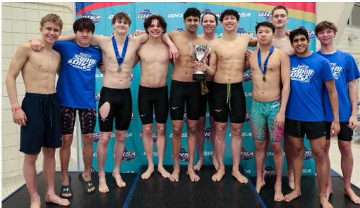
4A-5A Boys: Chattahoochee