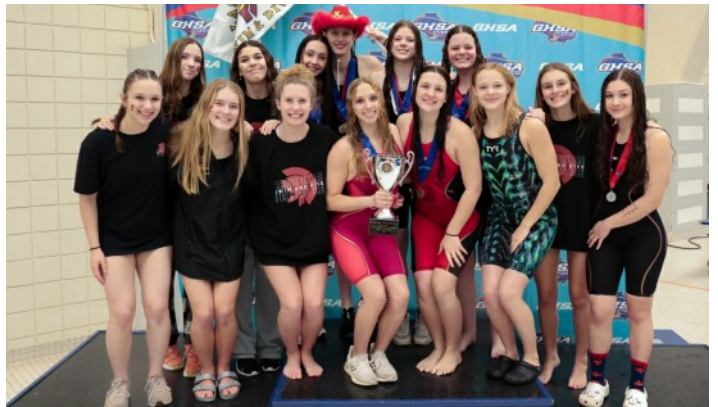
6A Girls: Lassiter