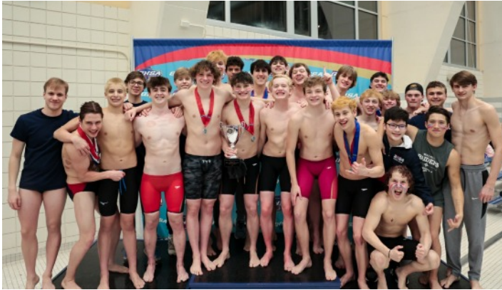
7A Boys: Walton