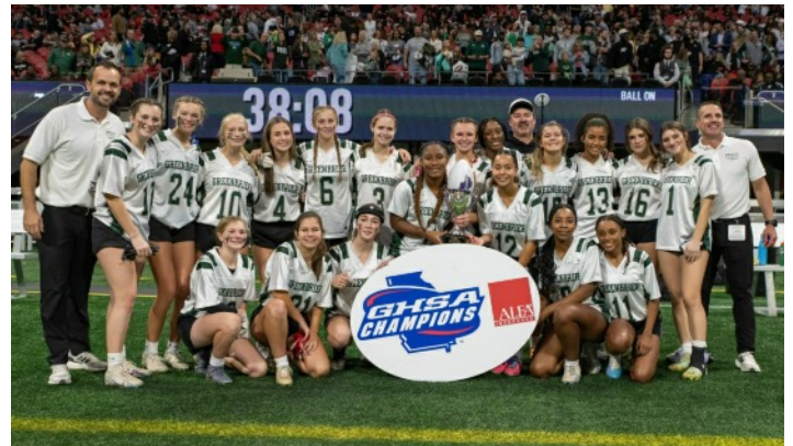
5A-6A (Division 2): Greenbrier