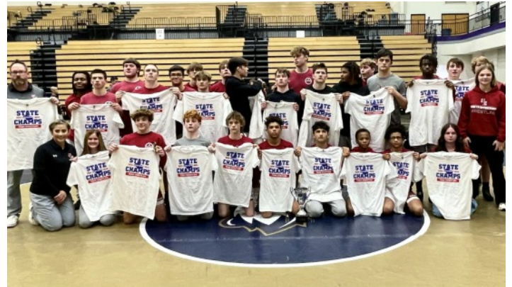
6A: South Effingham