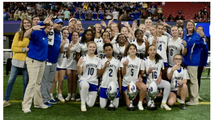
A-4A (Division 1): Southeast Bulloch