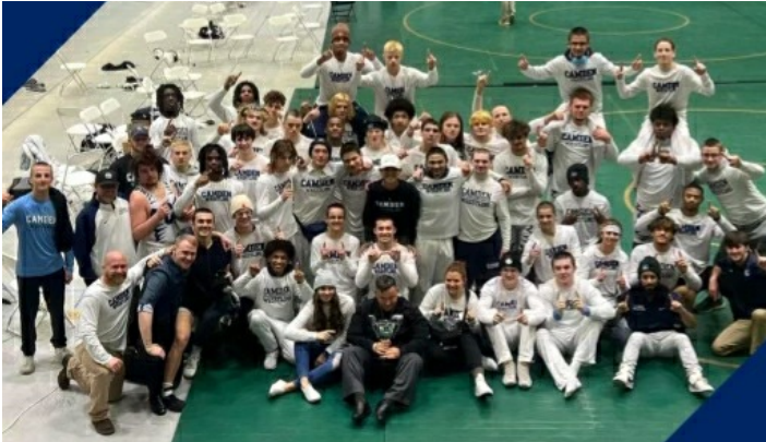
7A: Camden County