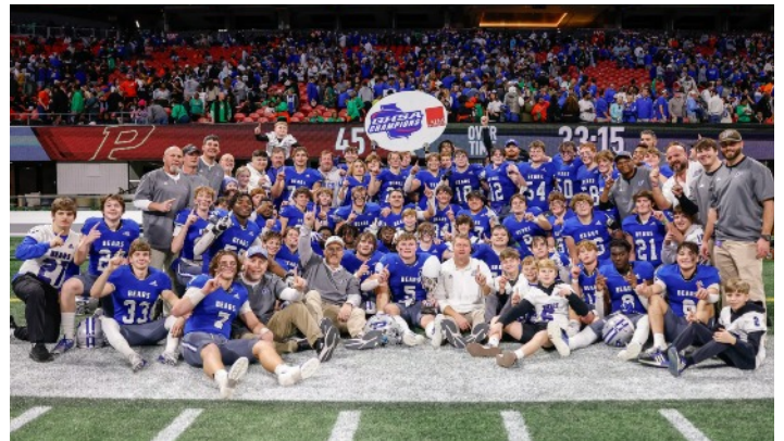
2A: Pierce County