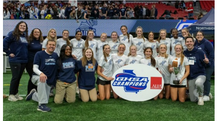
7A (Division 3): Pope

Congratulations to the 2023 GHSA Flag Football State Champions. Winning were Pope (7A), Greenbrier (5A-6A) and Southeast Bulloch three-peating in A-4A. Photos of the other Football champions may be found on the next page.