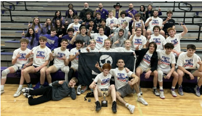
3A: Lumpkin County