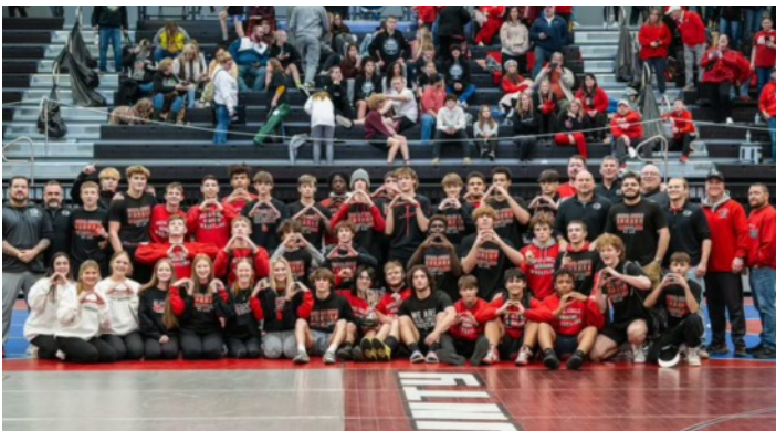
A: Social Circle