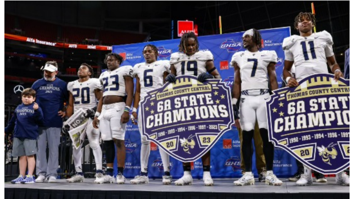
6A: Thomas County Central