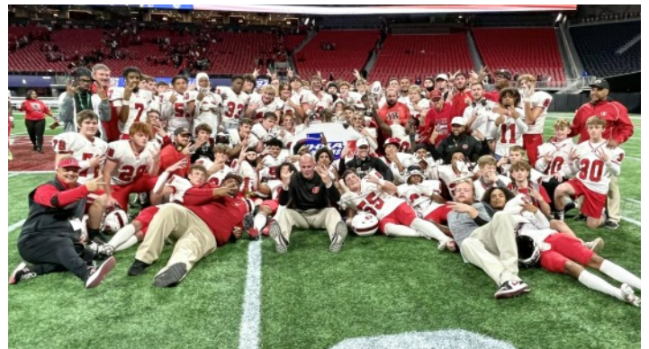
A, Division 2: Bowdon