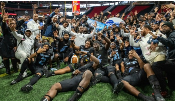
3A: Cedar Grove