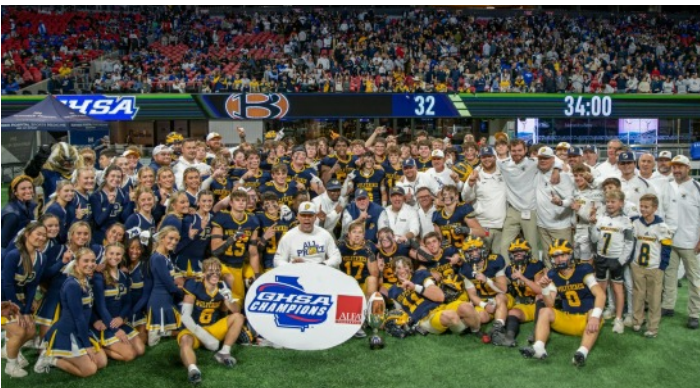
A, Division 1: Prince Avenue