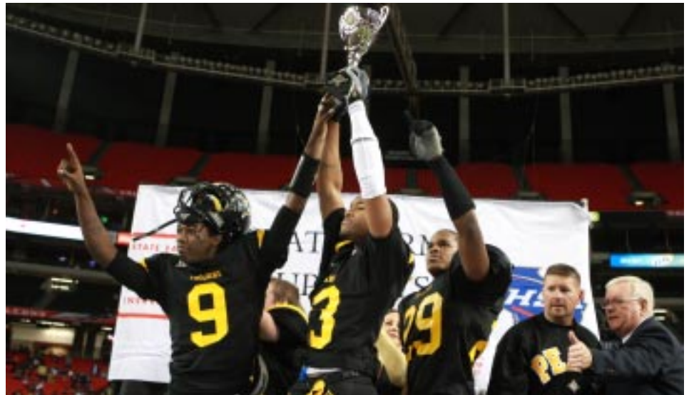
Class AAA Football: Peach County