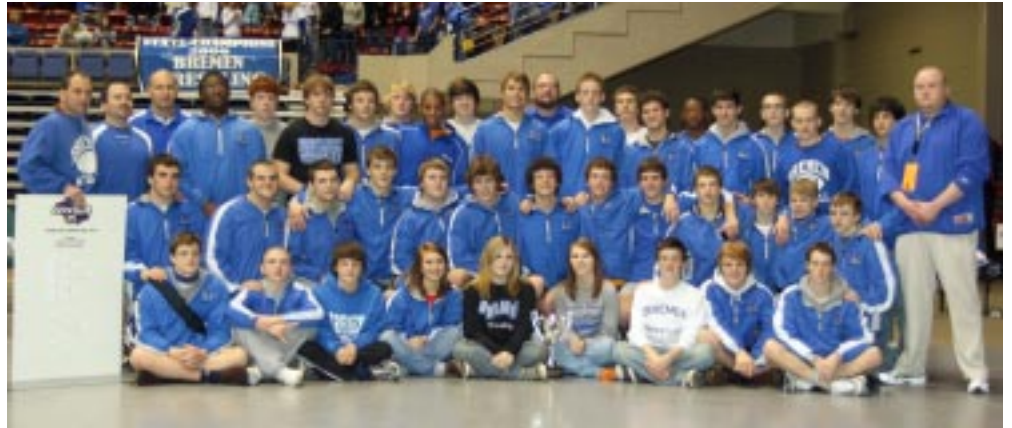
Class A Dual Wrestling: Bremen