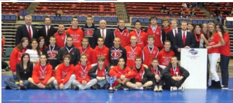
Class AAAA Dual Wrestling: Loganville