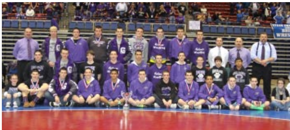
Class AAA Dual Wrestling: Gilmer