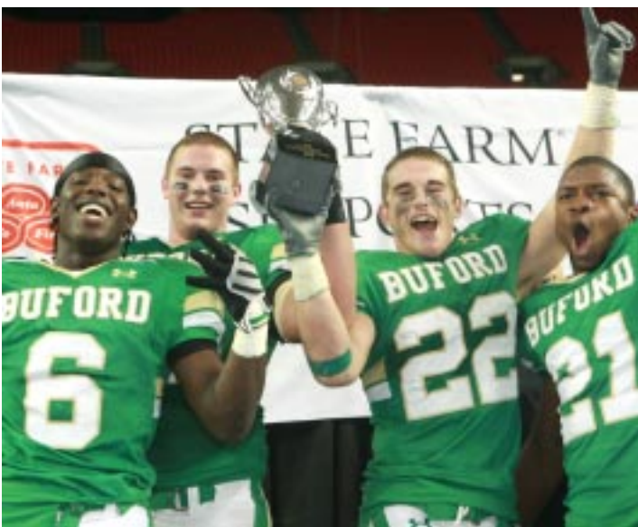
Class AA Football: Buford