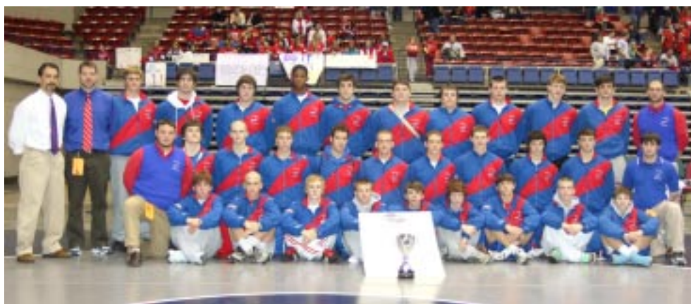
Class AA Dual Wrestling: Jefferson

Photos of the championship teams represented in this newsletter were provided by Photographic Arts . Other photos from the various GHSA state events can be found at www.schoolpix.biz .