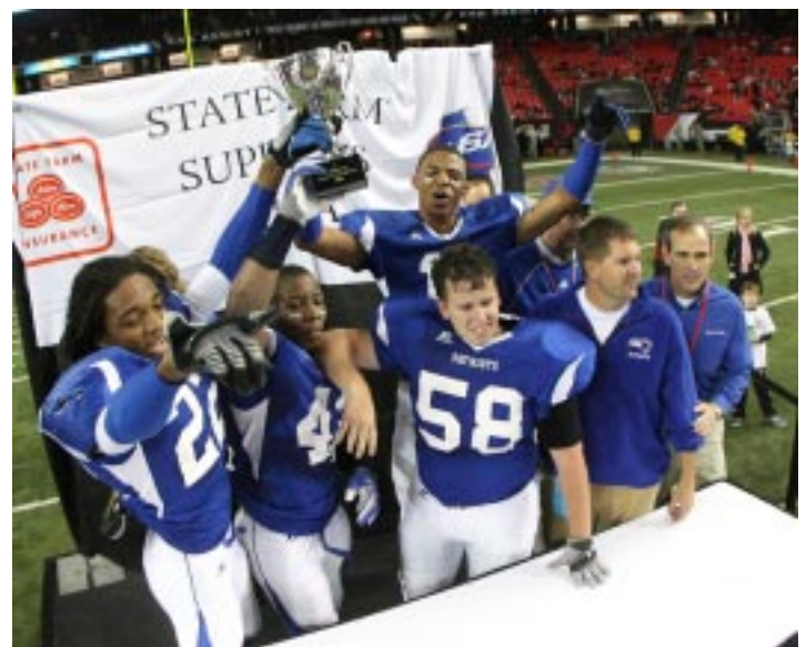
Class A Football: Wilcox County