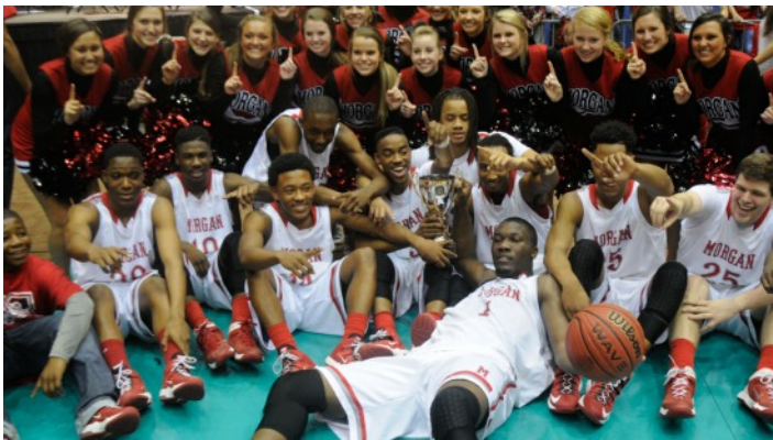
AAA Boys: Morgan County