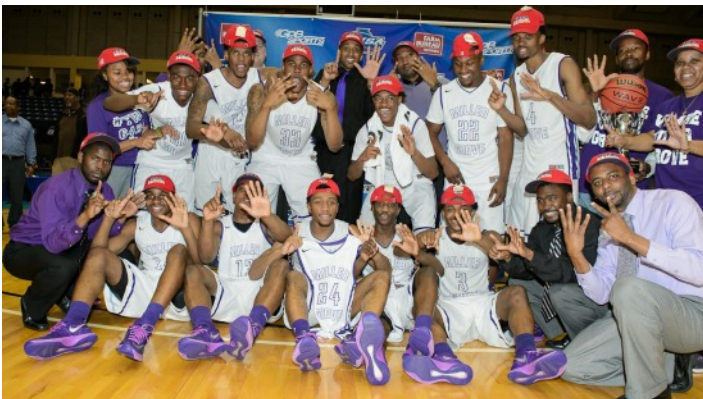
AAAAA Boys: Miller Grove