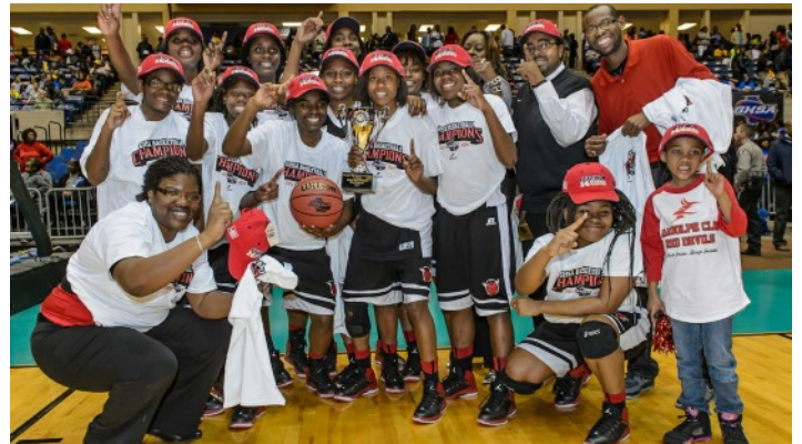
A (public) Girls: Randolph-Clay