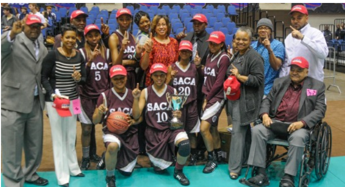
A (private) Girls: Southwest Atlanta Christian