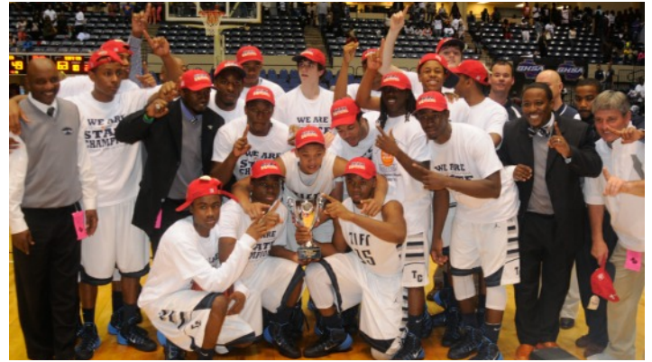
AAAAAA Boys: Tift County