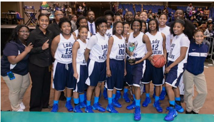
AAAA Girls: Redan