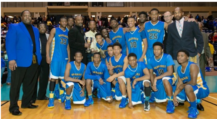
A (public) Boys: Wilkinson County