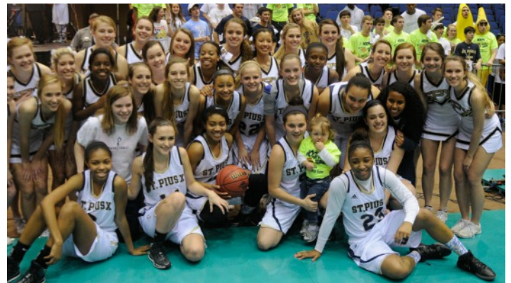
AAA Girls: St. Pius