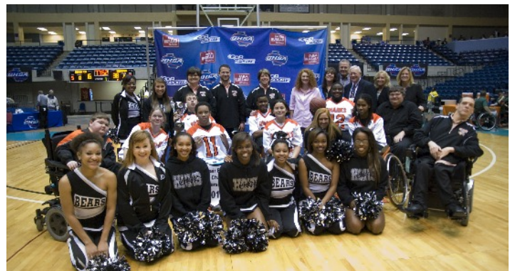
Wheelchair: Houston County