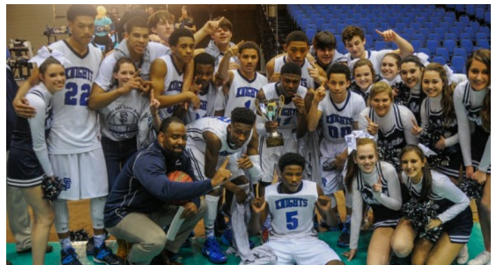
A (private) Boys: St. Francis