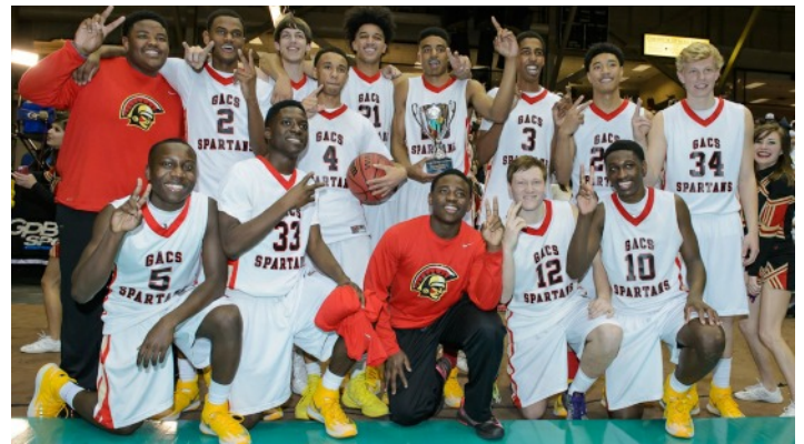
AA Boys: Greater Atlanta Christian