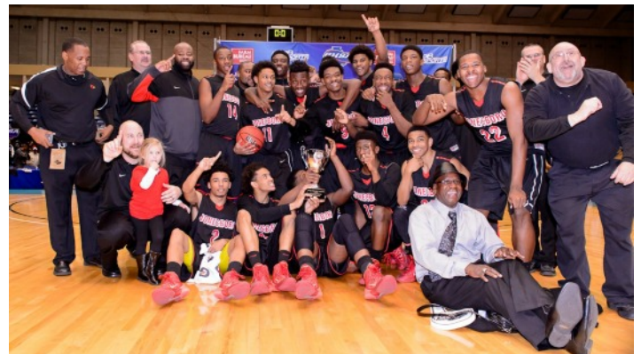
AAAA Boys: Jonesboro